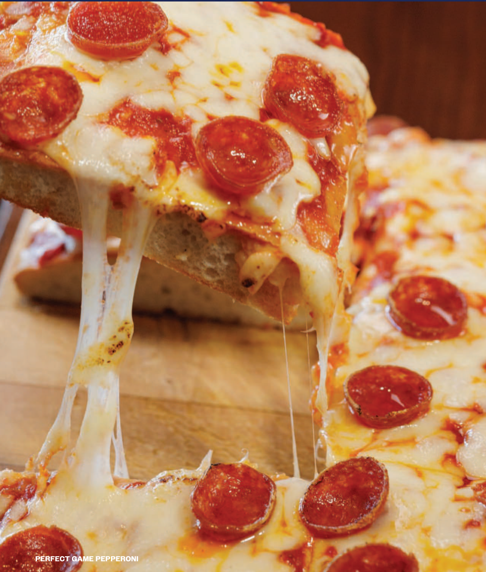
PERFECT GAME PEPPERONI