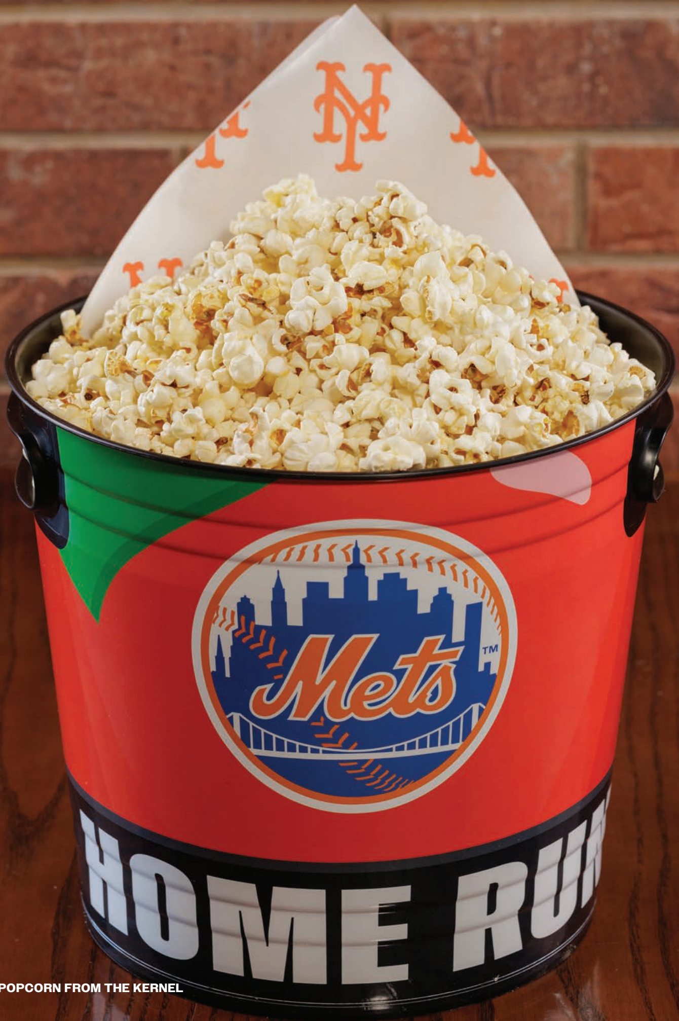
POPCORN FROM THE KERNEL