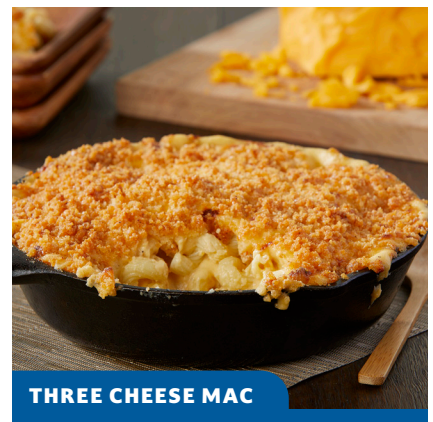
THREE CHEESE MAC

Pulled Chicken, Home-Made Buffalo-Style Hot Sauce, Mini Rolls, Cool Celery Blue Cheese Slaw