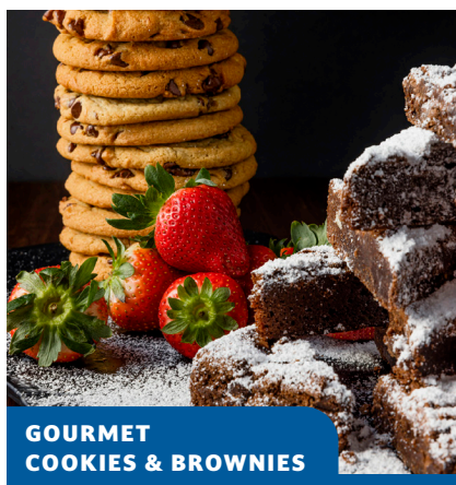
GOURMET COOKIES & BROWNIES

You will know when the legendary dessert cart is nearby. Just listen for the 'oohs' and 'ahs' as your neighbors line up in enthusiastic anticipation of our signature dessert cart.