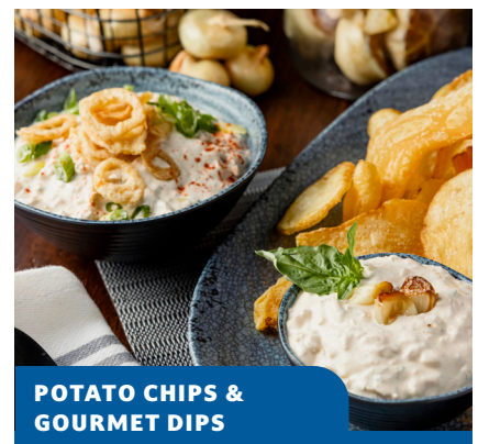
POTATO CHIPS & GOURMET DIPS

V // 57 per Order Potato Chips, Roasted Garlic Parmesan, French Onion and Dill Pickle Dip