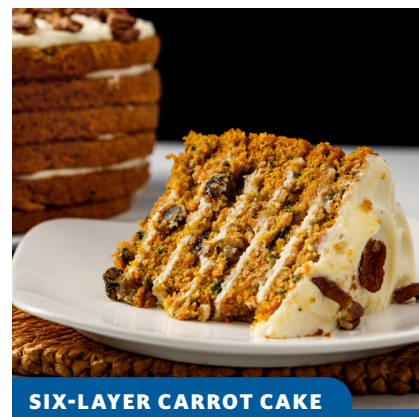
SIX-LAYER CARROT CAKE

Five-Layer Lemon Cake, Lemon Curd, Vanilla Icing, Dried Marshmallow Bits, Sour Lemon Bark